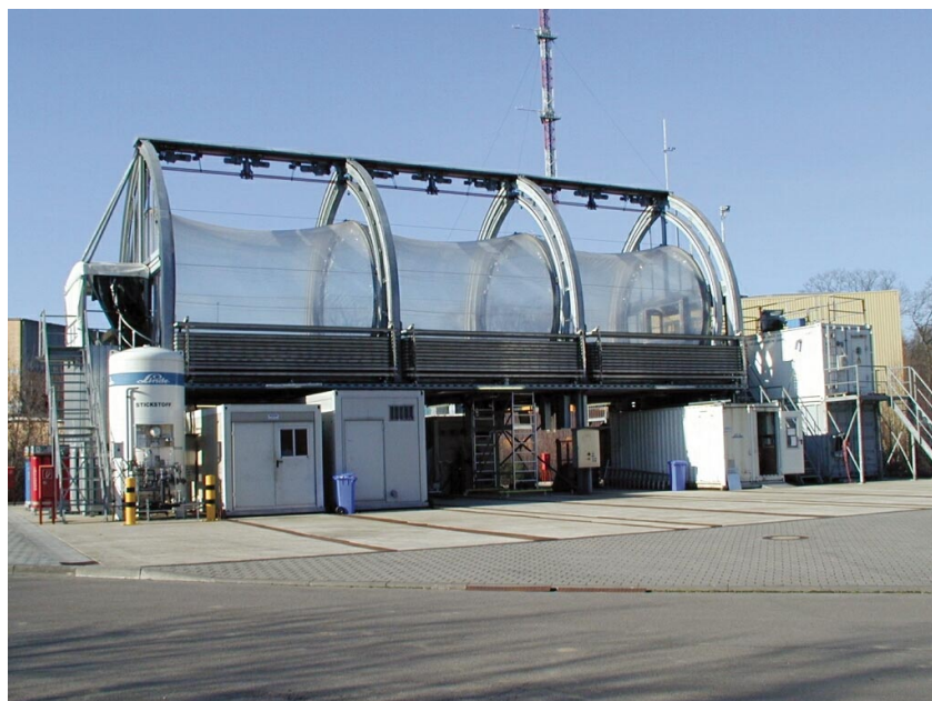
The SAPHIR simulation chamber at Jülich Research Centre, Germany

Atmospheric chemistry is a complex subject that draws on chemistry, physics, meteorology, computer modelling, oceanography, geology and volcanology. Like many other fields of natural science, it is studied in three main ways: by observing the natural world; by carrying out controlled experiments; and through mathematical simulation.