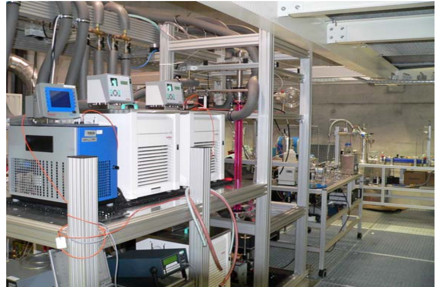
LACIS; IFT Leipzig